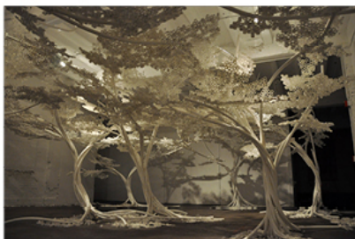
London's Tom Price creates 'cherry' PP Tree out of polypropylene tubes.

the furniture field's most ascendant arenas. Established in 2010, Industry is one of the nation's only design spaces solely dedicated to works produced in the 21st Century. Long a personal fan of ultra-contemporary design, Applebaum opened Industry out of a personal desire to expand acceptable notions of what makes design pieces not just covetable but truly collectible.