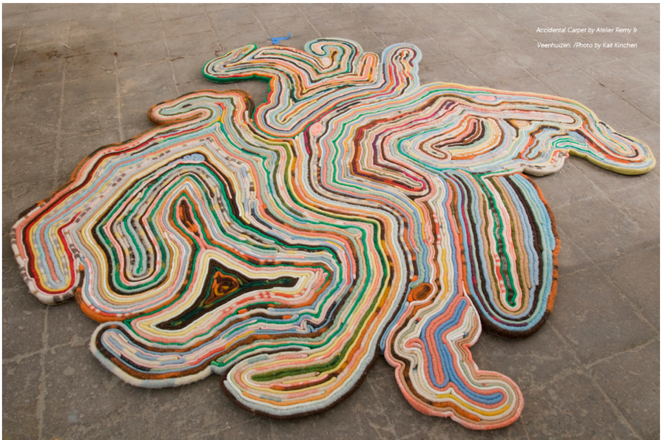
Accidental Carpet by Atelier Remy 9 Veenhuizen.