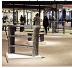
Industry's Los Angeles gallery.