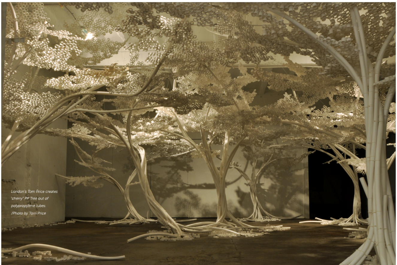
London's Tom Price creates "cherry" PP Tree out of polypropylene tubes